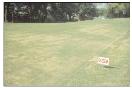
Figure 1. Golf course fairway damaged by white grubs.

White grubs, sometimes referred to as grubworms, injure turf by feeding on roots and other underground plant parts. Damaged areas within lawns lose vigor and turn brown (Figure 1). Severely damaged turf can be lifted by hand or rolled up from the ground like a carpet.