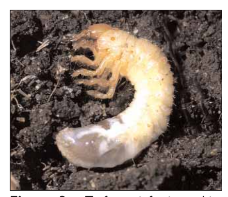
Figure 3. Turfgrass-infesting white grub larvae feeding on grass roots. Grubs are most damaging when they reach a length of \frac{1}{2} - to 1-inch.

Larva. White grub larvae are creamy white and C-shaped, with three pairs of legs (Figure 3). After hatching, the white grub passes through three larval life-stages, or instars. These instars are similar in appearance, except for their size. First- and second-instars each require about 3 weeks to develop to the next life-stage. The third-instar actively feeds until cool weather arrives. Third-instar larvae are responsible for most turfgrass damage due to their large size (1/2 to 1 inch-long) and voracious appetites. Feeding by large numbers of thirdinstar white grubs can quickly destroy turfgrass root systems, preventing efficient uptake of food and water. Damaged turf does not grow vigorously and is extremely susceptible to drying out, especially in hot weather.