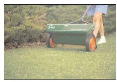
Figure 4. Drop-type spreaders allow precise placement of insecticide granules.

walks. Drop-type spreaders are less likely to scatter pesticide granules off of the target site than are rotary-type spreaders (Figure 4). Pesticide runoff from improper pesticide applications reduces the effectiveness of a treatment and can pollute above-ground and underground water supplies.