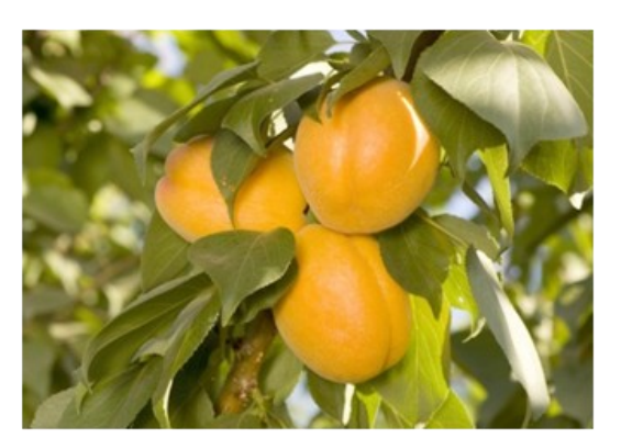
One of the many interspecific Prunus hybrids.

Numerous selections of interspecific hybrids in the Prunus genus exist today, namely plum by apricot and vice versa; commonly known as