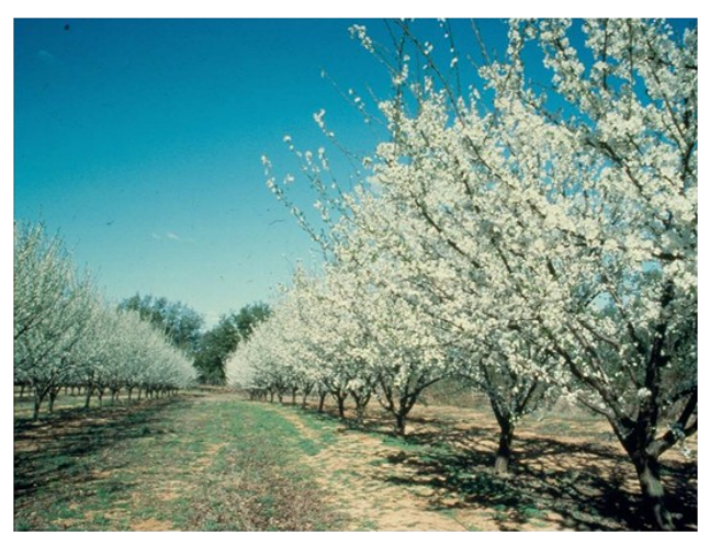
Plum orchard in full bloom

which is grown fresh and frequently dried and used as prunes. These varieties have poor production records in Texas because of a relatively high chilling requirement and high susceptibility to fungal diseases such as brown rot. The varieties adapted to Texas climatic conditions are usually hybrids between P. domestica and P. salycina and are known as Japanese or Japanese hybrid varieties.