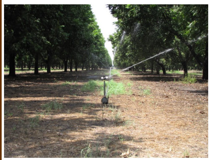
Solid set-type sprinkler irrigation

at least never be allowed to go longer than 21 days without water. Salts in the soil and/or water can significantly reduce growth or kill the trees in extreme cases. Potential pecan orchard sites or problem orchards need to have their irrigation wells tested for water volume, quality, and the cost of electricity for pumping the water. A good rule of thumb is to have a well capacity of 10 gallons of water per minute for each acre of trees.