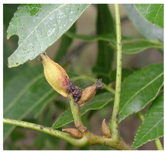
Damage from pecan nut casebearer larvae

todes, Cotton Root Rot, and Crown Gall are potential problems in some regions of Texas.