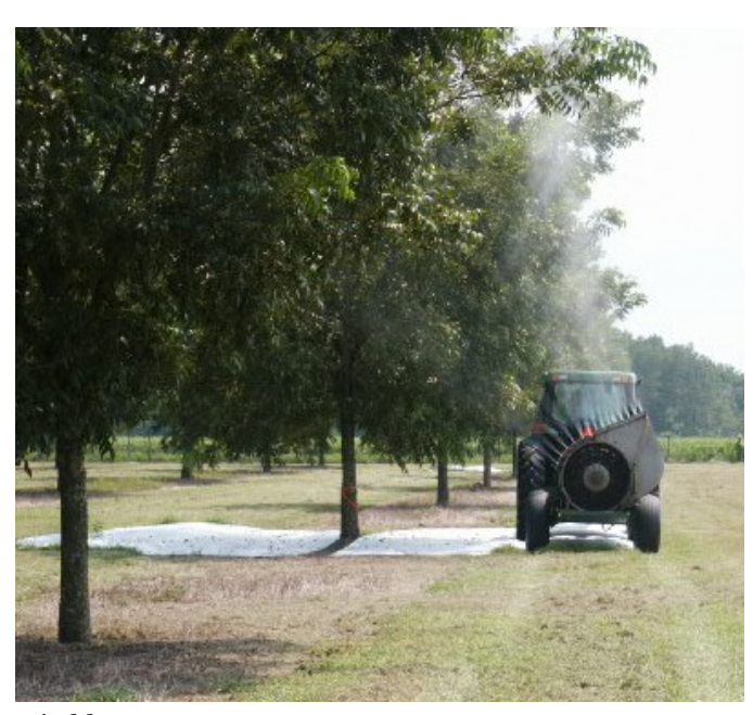
Air-blast type pecan tree sprayer

the spring, and it is unusual, although not unthinkable for the flower crop to be damaged by