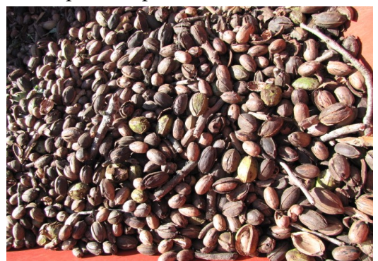
Machine-harvested pecans and trash before processing