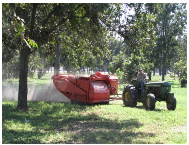
PTO-powered pecan harvester

to prevent kernel darkening, embryo rot, vivipary (sprouting), mycotoxins such as aflatoxin, and other problems related to moist pecans. Shucks not removed in the orchard by nature or the harvesting equipment are removed with dehulling equipment. In south Texas, where harvest is begun before the shucks are fully open to prevent vivipary, the shucks must be ground off in water with special equipment. Once deshucked, poorly filled pecans are vacuum sepa-