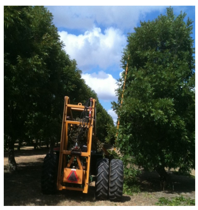
Mature, 30x30 spaced orchard hedged annually to maintain sunlight.

Future tree removal operations should be considered in the designed layout of main varieties, temporary varieties (if any) and pollenizers. Pollenizers should be located so that they will be present in the orchard after trees are strategically removed.