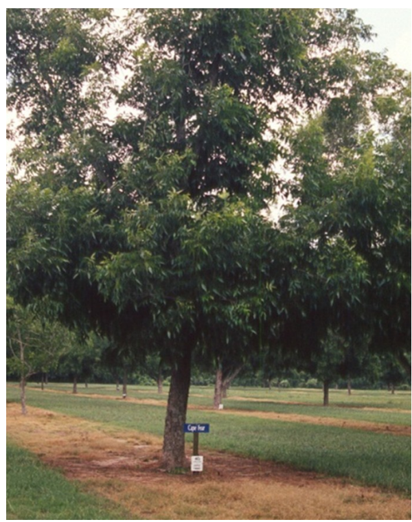
"Sod and Strip" orchard floor

Weeds must be controlled in young and mature pecan orchards to prevent reduced growth