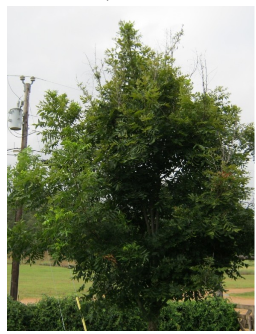
Pecan tree exhibiting severe zinc deficiency; bunchy canopy, small leaves, & limb dieback

Foliar Zinc Sprays are essential for pecan growth in Texas. Soil or drip system applications of zinc are not effective. Zinc is needed for leaf expansion, so applications should be made frequently in the early portion of the growing season for maximum growth. Two products, zinc sulfate wettable powder or liquid zinc nitrate, are used with equal success. Liquid nitrogen (32% urea ammonium nitrate) can be added to either zinc