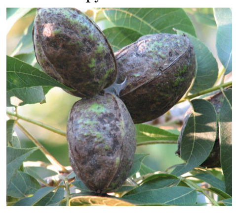
Pecan scab on pecan shuck

rainfall is prevalent. All growers may encounter Downy Spot, Powdery Mildew, Shuck Dieback, Stem-End Blight, Bacterial Leaf Scorch, among others. Rootknot nema-