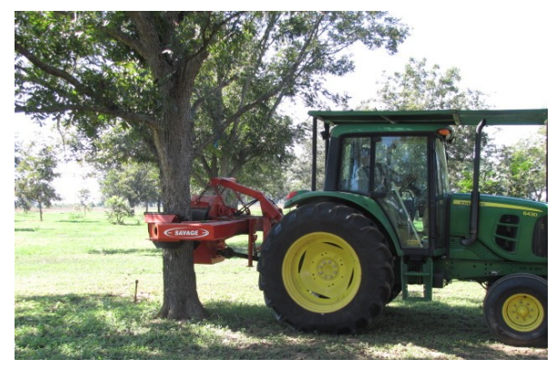
PTO -powered trunk shaker

Processing pecans immediately after harvest is needed to obtain a good early season price and