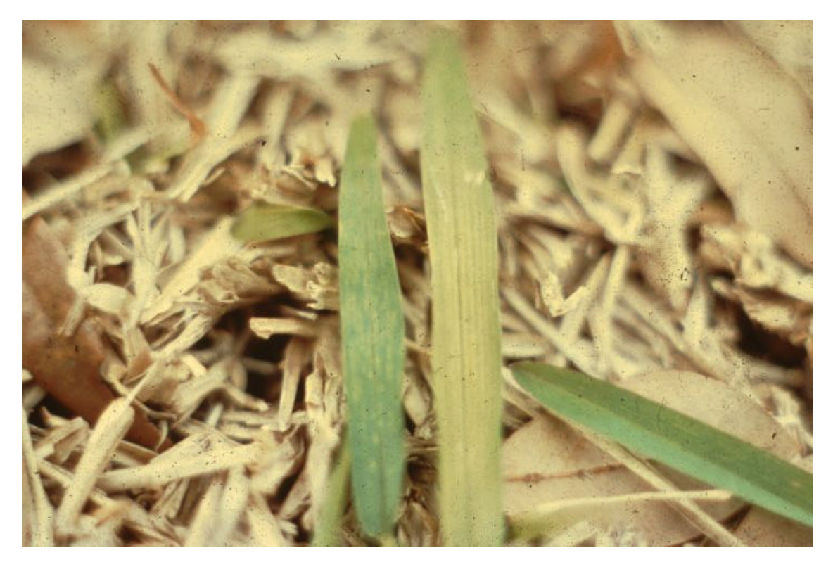
Picture 9: SAD lesions on left leaf blade of St. Augustinegrass (left) and iron chlorosis on leaf blade of St. Augustinegrass (right).

Being a virus problem, there are no chemical controls available to treat SAD. The best recommendation is to plant varieties of St. Augustinegrass that have known resistance to this viral disease problem. St. Augustinegrass varieties with known resistance to SAD include: Floratam, Raleigh, Seville, Delmar and AmeriShade. Note, varieties such as Floratam and AmeriShade should not be planted north of the Austin/San Antonio area due to poor cold tolerance.