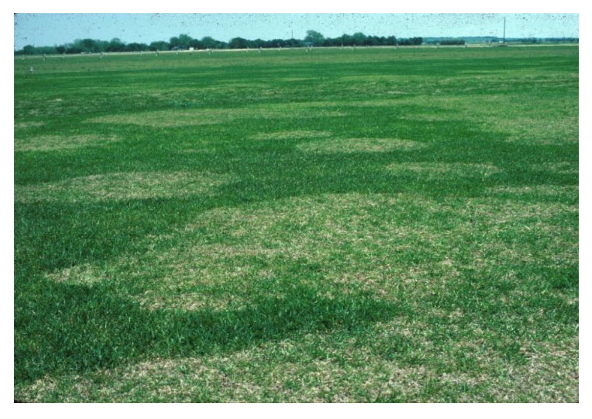
Picture 5: St. Augustinegrass growing on sod farm with brown patch activity.

Brown patch can be a problem in most warm season and some cool season turfgrasses, but is especially a problem in St. Augustinegrass and centipedegrass lawns (see picture 5). The fungus is primarily a problem in warm season turfgrasses in the fall and early winter months when nighttime temperatures are below 70^{\circ} F and daytime temperatures are in the 75 to 85^{\circ} F range. Brown patch can be active in the spring and it has been reported to be a problem in several areas of Texas in the spring of 2007. The above rainfall conditions and mild temperatures have most likely resulted in brown patch being active in the spring of 2007.