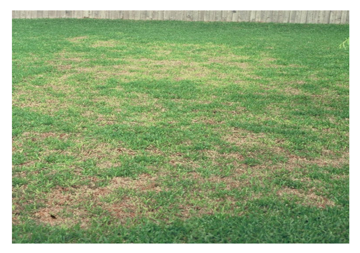
Picture 3: St. Augustinegrass lawn damaged by Nigrospora Stolon Rot.