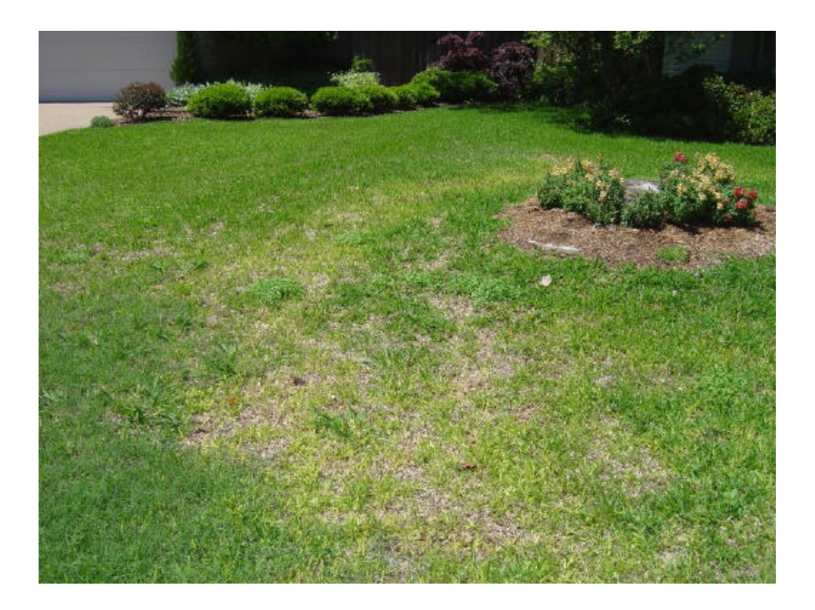
Picture 1. St. Augustinegrass lawn damaged by Take-All Root Rot. Note the yellow St. Augustinegrass throughout the affected area of the lawn.

firmly attached, brown stolons (runners) and a shortened root system that is dark brown to black in color.