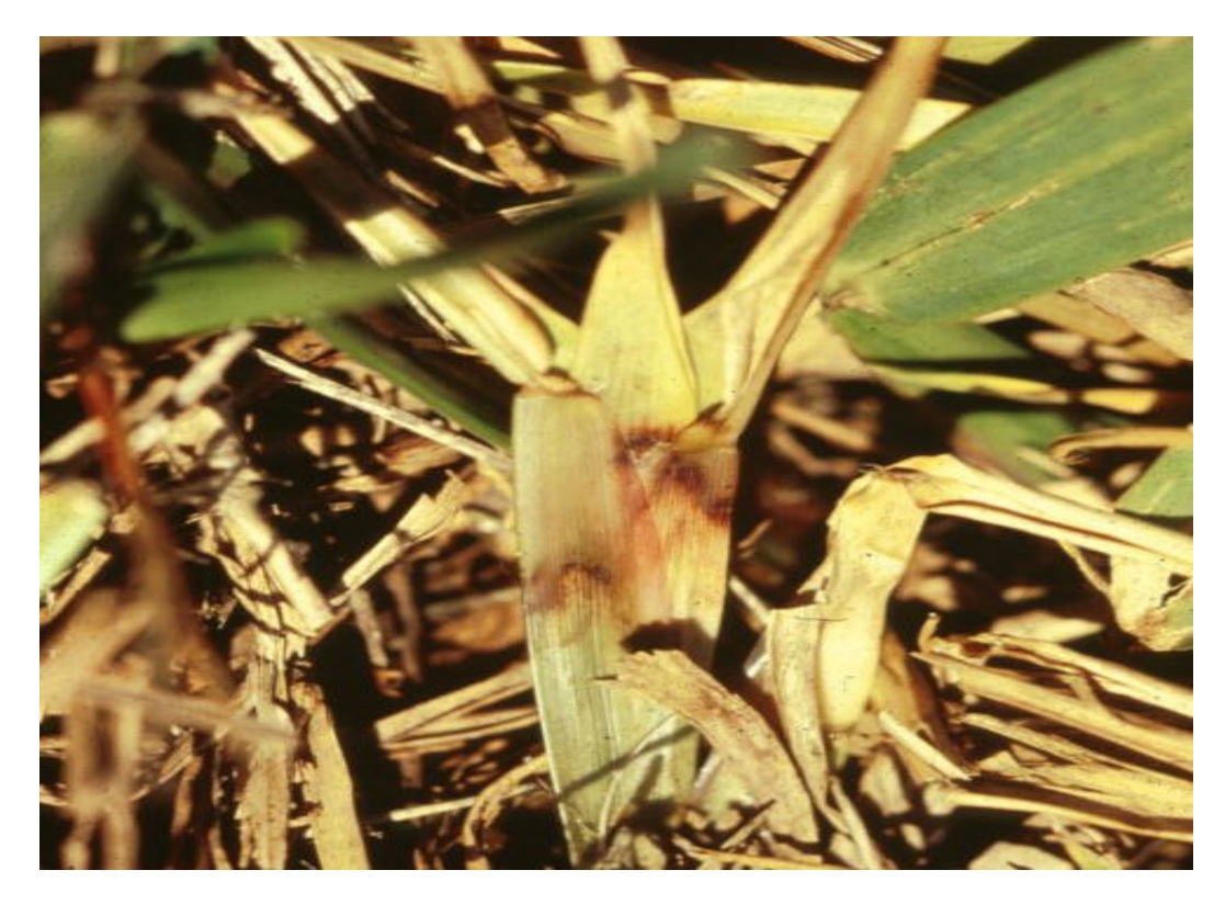
Picture 6: Rotted leaf sheath on St. Augustinegrass leaf blade caused by brown patch.