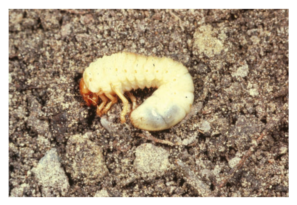
Picture 12: Larval stage of the white grub. Note the creamy white color with C-shape. Also, note that the larval stage has three pairs of legs.