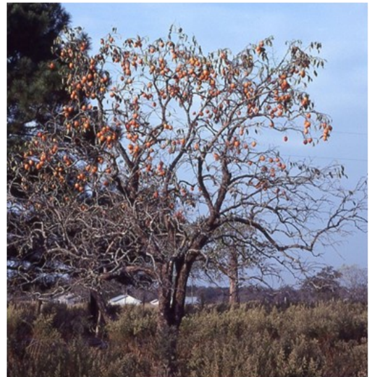
Common American persimmon

fallen from the tree. Even at this late date some fruit can still be very astringent. Wild animals, such as the opossum and raccoon, feed heavily upon the common American persimmon. Persimmon wood is very hard and is used for manufacturing golf clubs and is prized by woodworkers. The common American per-